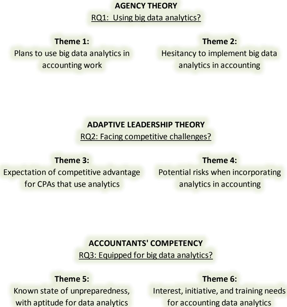
Figure 3. Association of Themes to Research Questions and Conceptual Framework

graphic also exemplified each theme's association with one of the three concepts or theories that established the study's conceptual framework, comprised of (a) agency theory, (b) adaptive leadership theory, and (c) accountants' competency.